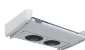
XARIOS 5 MXL 1100