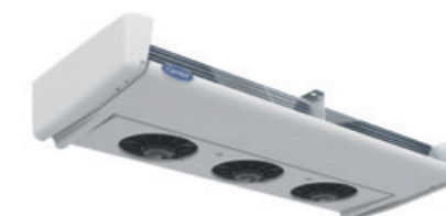
XARIOS 8 MXL 1550+