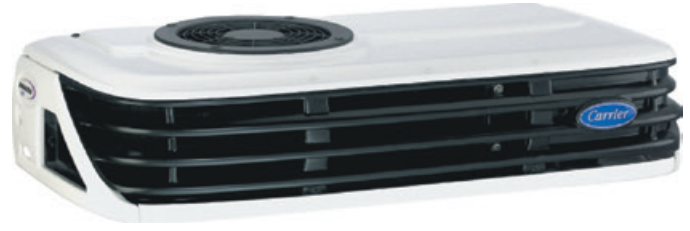
300, 350, 350MT XARIOS