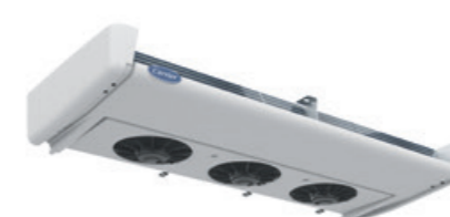
XARIOS 6 MXL 1550